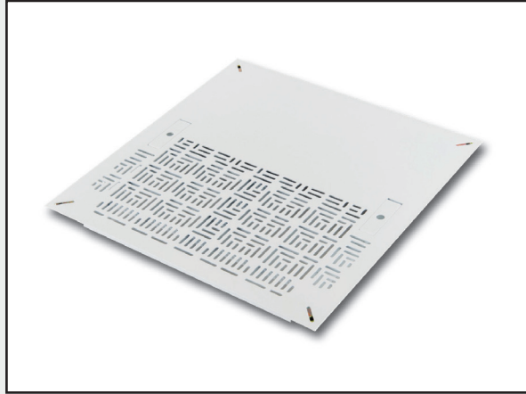
Hybrid Chamfer Panel Crystal White

Align our patented stratification fin to direct air exactly where you need it