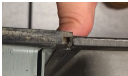
High Pressure Laminate Thickness 1/8 inch (left) vs. 1/16 inch (right)